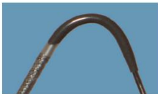
NX31413525, NX31415560 Soft Tapered Tip