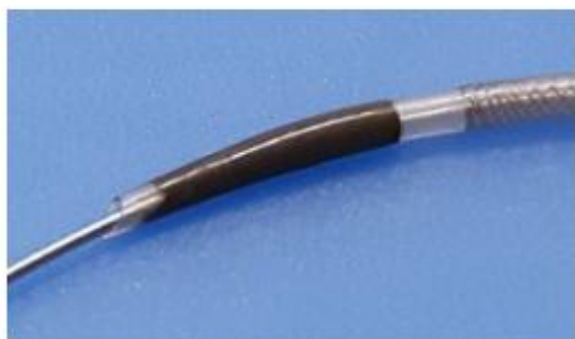
NX61413525, NX61415560 Large Lumen Mosquito Tip