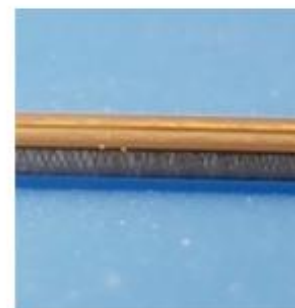
1:1 Push & Transmi

The catheter is intended to support a guide wire during access of vasculature and allows for exchange of guide wires and provide a conduit for the delivery of diagnostic contrast agents.