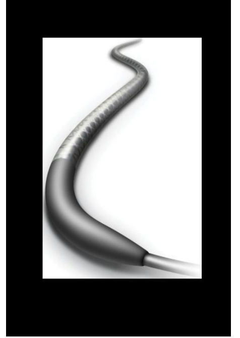
Microcatheter Nhancer ProX